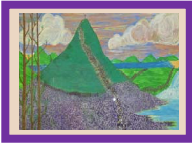
A Church for All Nations and A Fellowship of Living Grace!